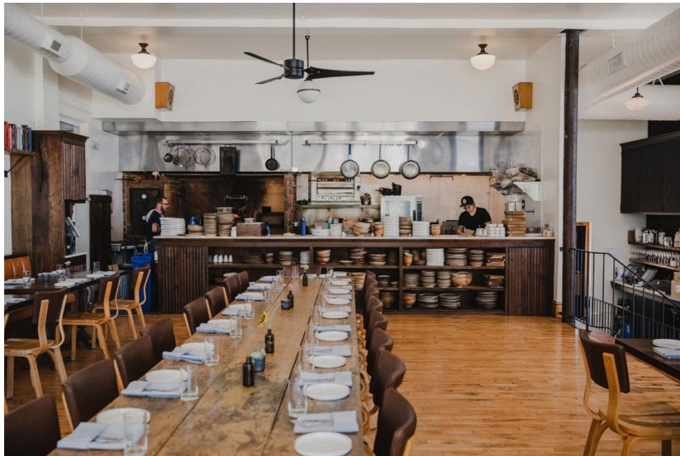
Upper Dining/ Kitchen Level (Seating for 38, including 18 at a communal chef's table)_Wood tables and warm, comfortable banquettes and an antique farmhouse chef's table, all offering views of the open kitchen with wood-fired cooking hearth