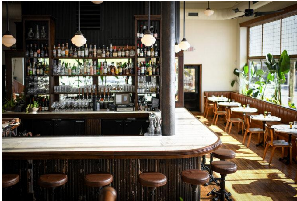
Main Level (Seating for 45; including 17 at bar) Light and bright, reclaimed white marble bistro-style tabletops and round booths surrounding the bar